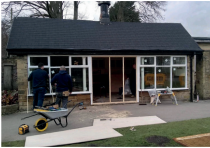
Above: Renovations work at the Veterans' Hut in Myrtle Park; below: new raised planting beds in Cottingley village centre.