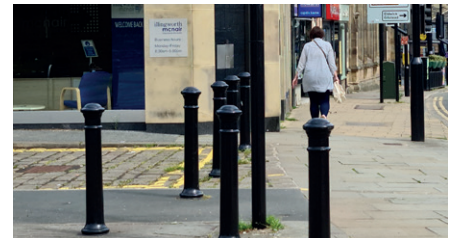
Bingley Airedale who sponsored the painting of the benches in the Market Square in the spring of 2019.